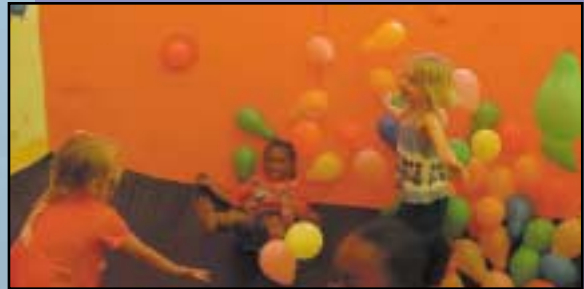
The Lighthouse at Austin Homes