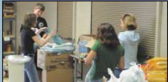
The Hands & Feet Services Center