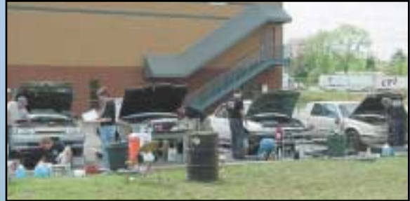
Christian Automotive Ministries

Empowering people for life transformation by serving as the hands and feet of Jesus Christ.