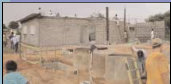
Hands & Feet International Ministries