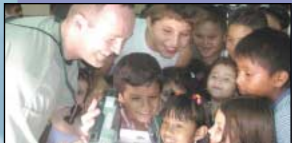
Hands & Feet Media Ministries

"... whatever you did for one of the least of these brothers of mine, you did for me."